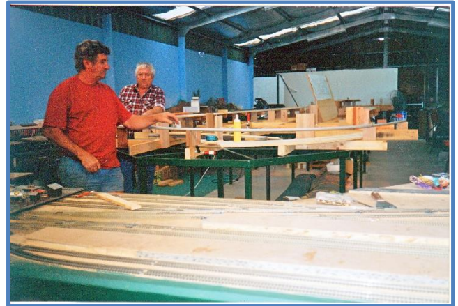
Archive Photographs of the Main Layout Construction.